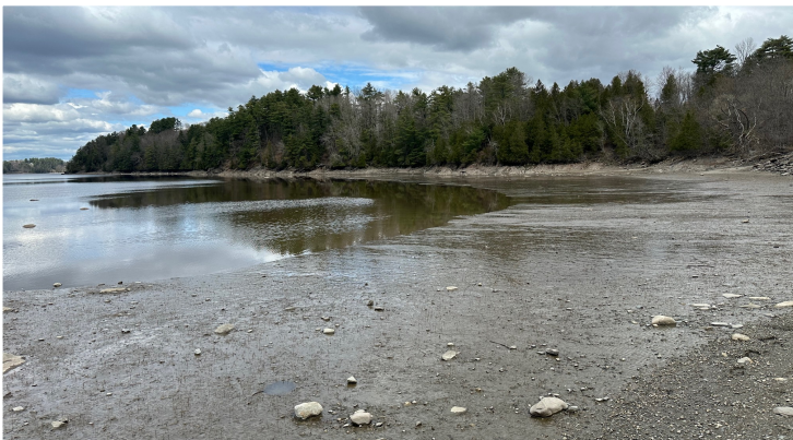
This photo shows East Cove 3 during low tide in May 2024.

Because the TLC Pilot area is adjacent to protected natural resources in coastal wetlands and the Penobscot River, the Remediation Trust needs a Natural Resources Protection Act (NRPA) permit from the Maine Department of Environmental Protection (DEP) and the U.S. Army Corps of Engineers (USACE). Maine DEP and USACE will review the NRPA permit application with other agencies (Maine Department of Marine Resources, Maine Inland Fisheries and Wildlife, U.S. Fish and Wildlife Service, and U.S. Environmental Protection Agency) and seek public comment.