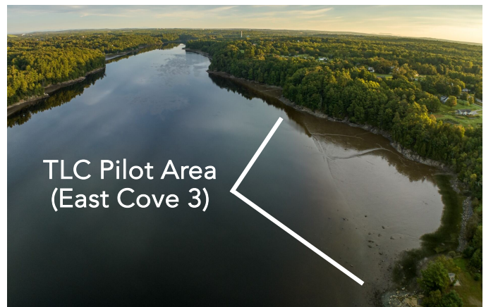
TLC Pilot Area (East Cove 3)

For updates: penobscotriverremediation.com